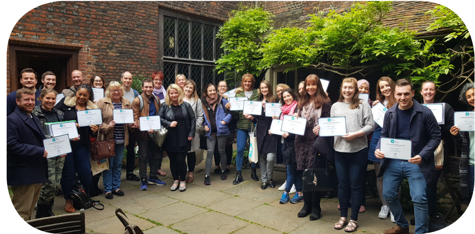
Oracy Pioneers Programme (London Cohort), 2018-2019

As an expert practitioner, you will also be well-equipped to support the development of others' classroom practice, leading practical and engaging CPD, observing, team teaching and modelling good practice .